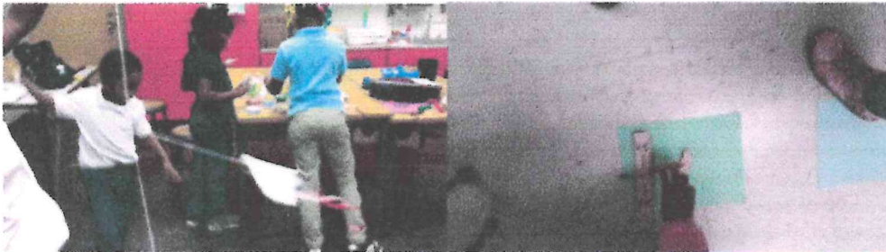
November 3 System Staff In-Service Day, Mandated Reporter Training.

New Fax machine, also does Wi-Fi printing.